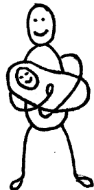
FATHER or MOTHER