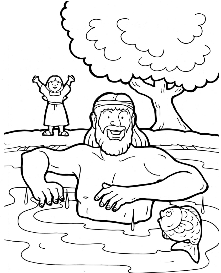
©1997 by Gospel Light. • Permission to photocopy granted. • Bible Story Coloring Pages • 105