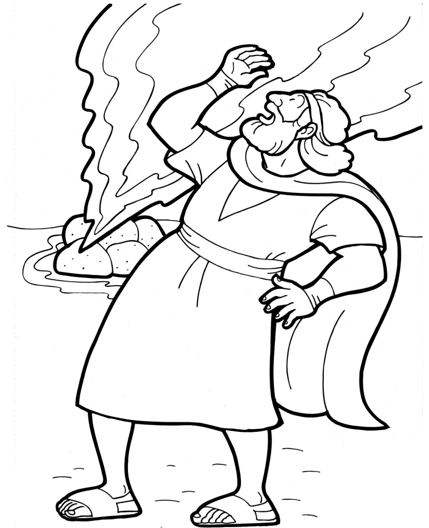
©1997 by Gospel Light. • Permission to photocopy granted. • Bible Story Coloring Pages • 99