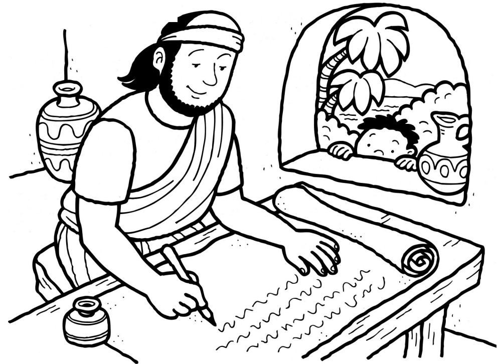
© 2002 Gospel Light Permission to photocopy granted. Bible Story Coloring Pages #2 • 109