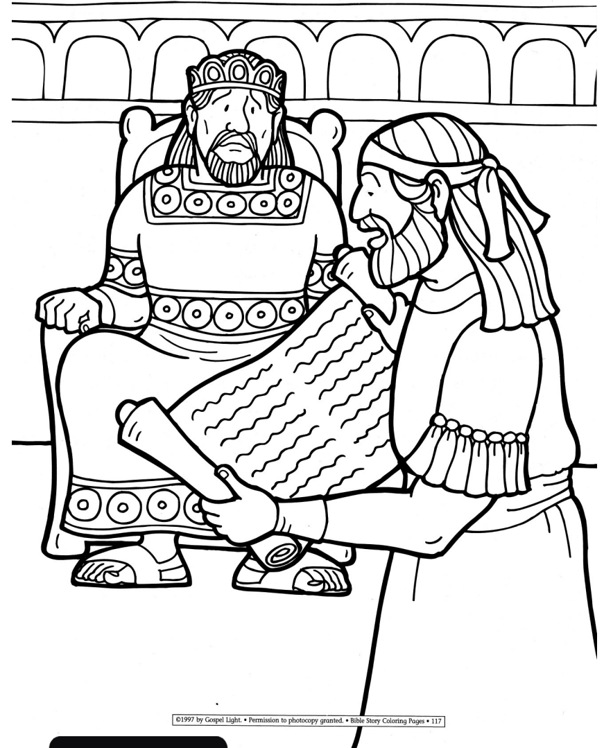
©1997 by Gospel Light • Permission to photocopy granted. • Bible Story Coloring Pages • 117