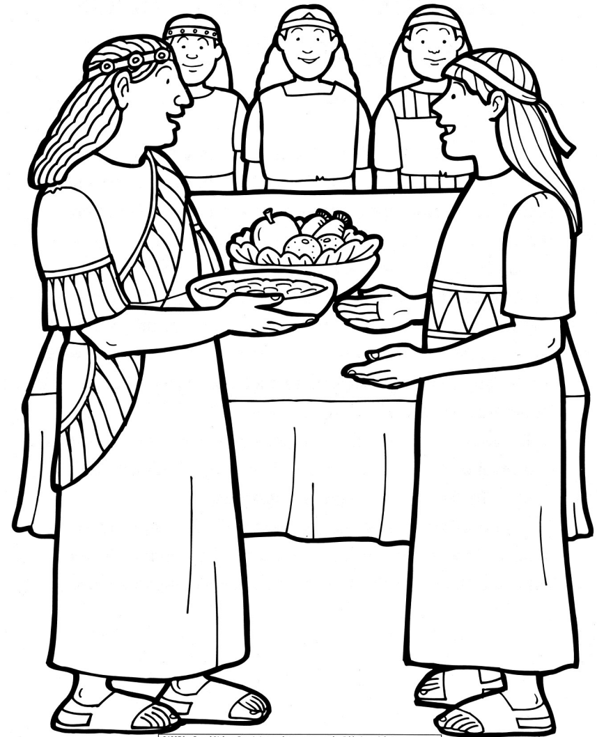
©1997 by Gospel Light. • Permission to photocopy granted. • Bible Story Coloring Pages • 121

According to the verse, what is the Lord setting before us?