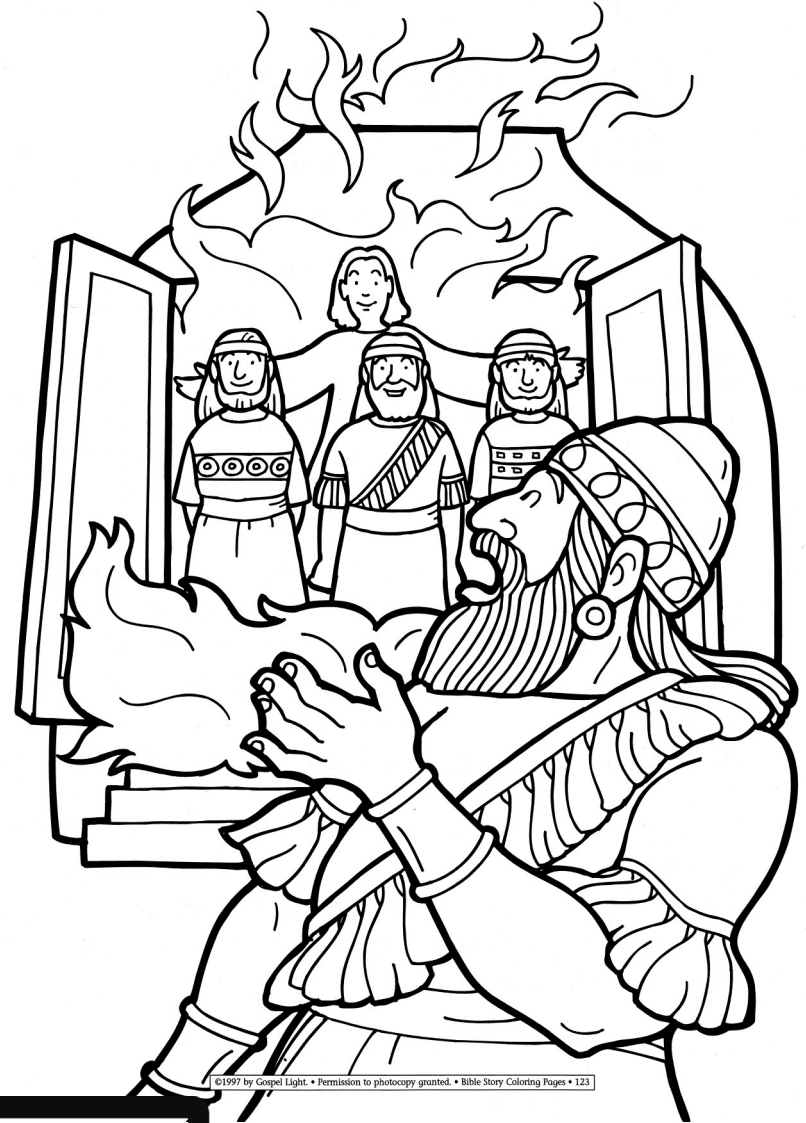
©1997 by Gospel Light. • Permission to photocopy granted. • Bible Story Coloring Pages • 123