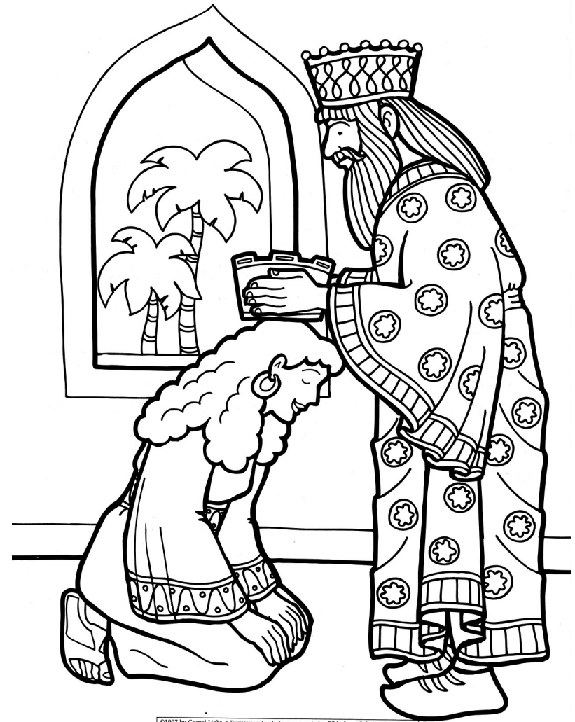
©1997 by Gospel Light. • Permission to photocopy granted. • Bible Story Coloring Pages • 127