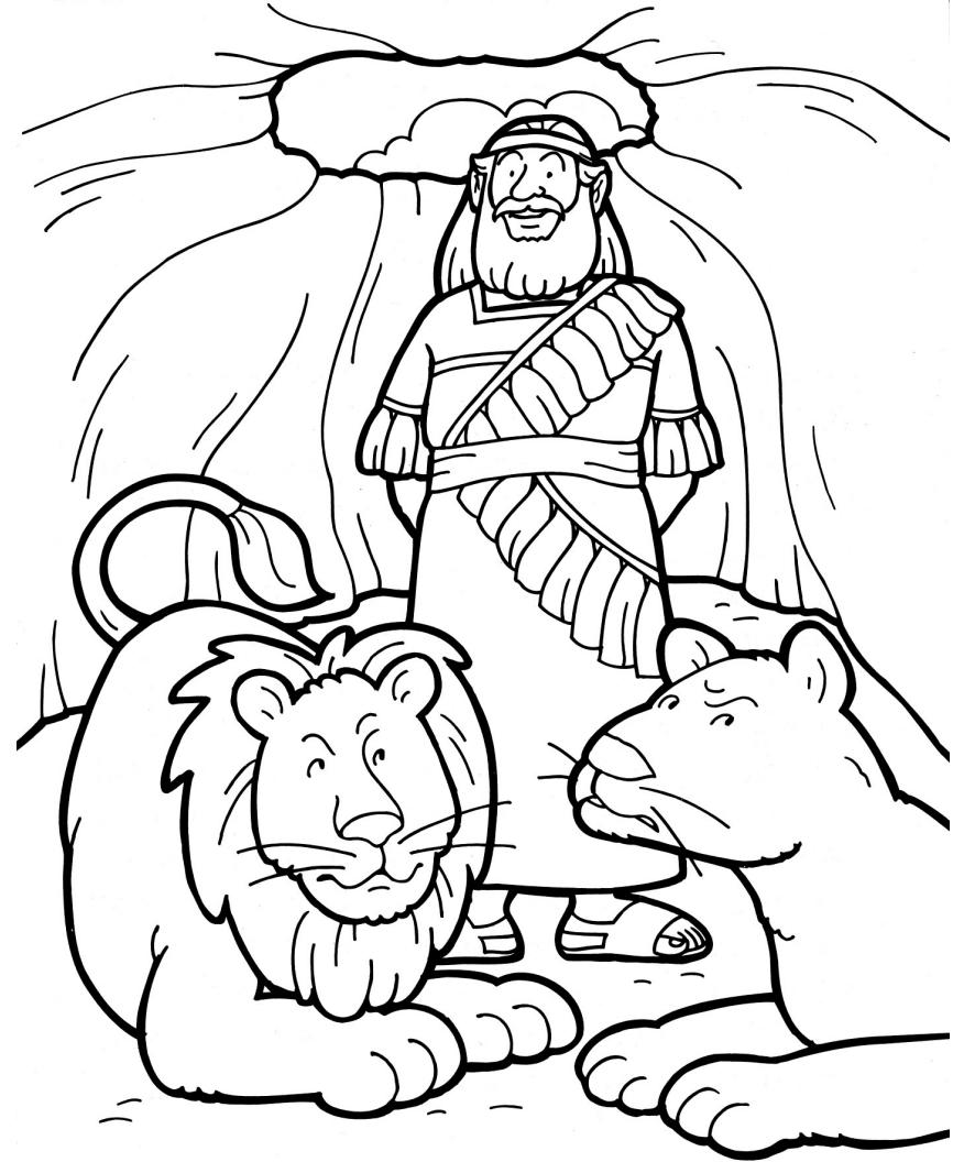
©1997 by Gospel Light. • Permission to photocopy granted. • Bible Story Coloring Pages • 125

What two things should we do for the Lord?