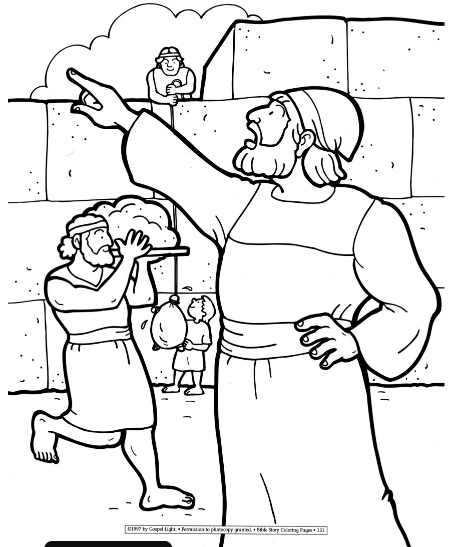
©1997 by Gospel Light. • Permission to photocopy granted. • Bible Story Coloring Pages • 131